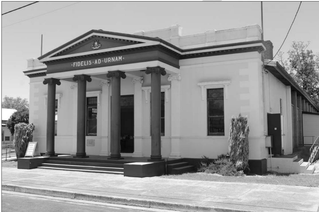
Baradine Memorial Hall